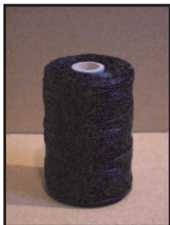
Black waxed linen thread – not recommended

Hemping: All joints should be appropriately hemped with the yellow unwaxed hemp. The initial 4 or so feet of the hemp should be waxed with the black cobblers wax so it grips on to the wood of the drone or chanter. The Black pre-waxed linen thread should be avoided as it does not bed down well requiring the joint to be very tight, and once the wax wears off the thread, the thread itself is very abrasive of the black wood it comes into contact with. If our bagpipe is to endure beyond the present generation, properly hemped joints (please forgive the pun!) are vital.