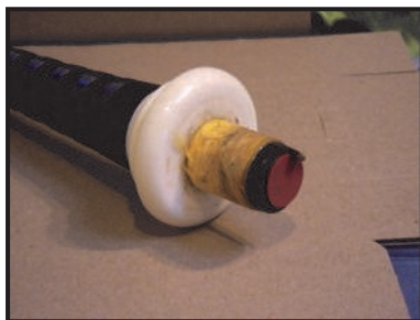
Flapper type valve recommended

The Blowpipe: This must be one of the more neglected areas of bagpipe maintenance. Ensure the blowpipe is pulled through regularly to remove the build up of 'gunk' inside. Ensure pipers have a flapper type (or similar) valve and not one that is inserted into the bottom of the blowpipe – these will restrict the amount of air you can get into the bag in the same period of time and will therefore make your pipes harder to blow. The blowpipe and mouthpiece bores would also be worth looking at – anything less than about a 9mm bore will mean you have too much resistance in the blowpipe and your pipes will be harder to blow.