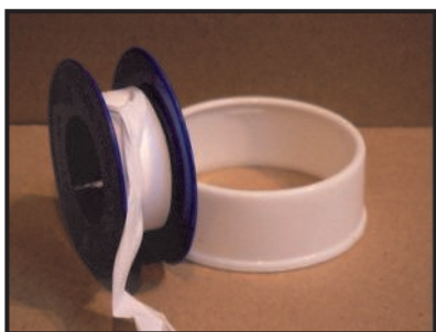
Thread Tape – minimal use on tuning slides only

Enemy number 2 would be PTFE tape, alias plumbers tape, or thread tape. It is fine to use one or two layers of this tape on the tuning slides only (just the lower tuning slide of the bass drone) but no where else. It does not aid in making the joint airtight, and may even assist the chanter to slide out of the stock during a performance.