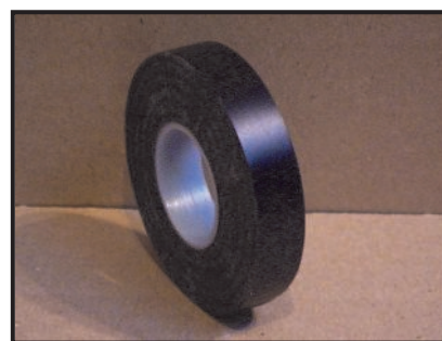
A double layer of this tape on the pipe chanter

The Pipe Chanter: There are a couple of aspects here that require attention. The first would be to ensure that the yellow hemp on the bottom of the reed has been waxed with black cobblers wax. This ensures that it grips on the wood/plastic inside of the reed seat and will not come loose or fall out easily. The second is chanter tape. I firmly recommend the use of the thin electricians tape and to wrap the tape around the hole twice. This makes for a stronger hole and tape will be less likely to slip. It does require maintenance and the Pipe Major would be well advised to ensure he/she checks all of the pipers chanters at least a week before the contest. It would also be good practice to have a spare piece of tape on the sole of the chanter to use in an emergency.