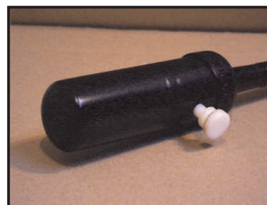
Plastic Dummy Stock

All pipers should have a plastic or blackwood (not a light wood) dummy stock, without a hole in the end to keep their pipe chanter in when not playing and when the pipes are packed away. The idea is to maintain a certain amount of moisture in the cane of the reed – not too much and not too little. If the reed is put away in a light wooden dummy stock or one with a hole in the end, the potential is there for the reed to dry out too much, giving it a higher pitch. If the reed is put away in a plastic or blackwood dummy stock when it is wet, then too much moisture will be retained and the reed will cultivate mould. After playing, if the reed feels damp to touch, it should be left out for 10 minutes to air and then be put away when it feels dry to the touch.