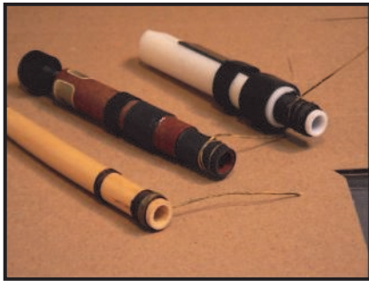
Spare hemp end on each reed

Drone Reeds: Whatever make or type of drone reed being used in the band, it is always advisable to leave a small amount of hemp on the reed seat end of the reed so that when inserted into the stock, the spare end is trapped between the inside of the stock and the hemp joint of the drone. It will be impossible for the reed to fall out of the drone during a performance!